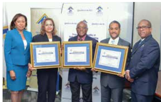
Representatives of the institutions proudly display their certificates of Institutional Accreditation