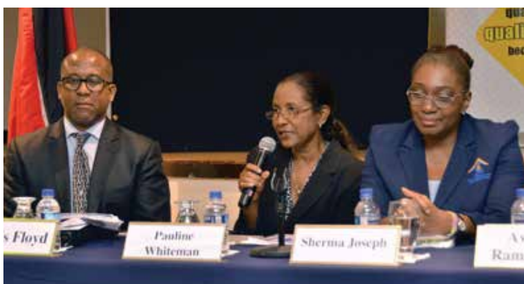
Panellists from the ACTT and NTA at the CQF Public Sensitisation Forum in Tobago