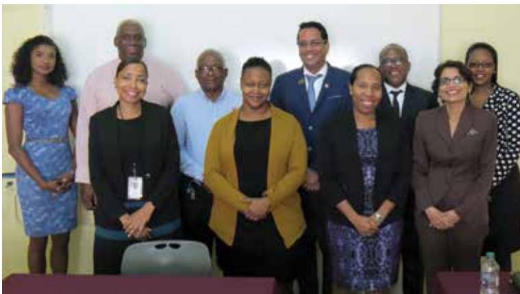
Staff members of the ACTT and West Indies School of Theology

The ACTT will continue with these meetings in the next period.