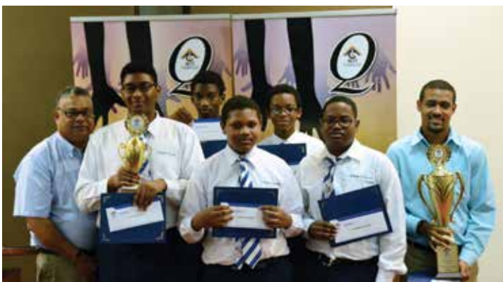
1st Place winner of the ACTT's 5th National Quiz on Quality Assurance in Higher Education and Training – St Mary's College.