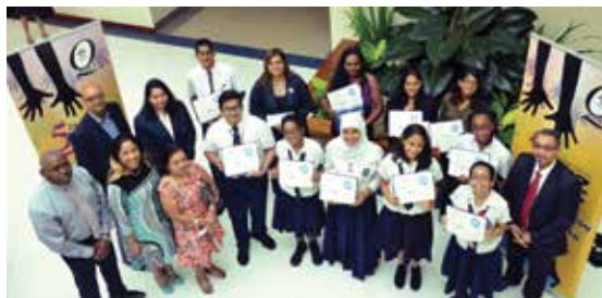
Winners of the ACTT's National Essay Competition.

The Essay component of the competition targets secondary school students of Forms 5 and 6 and undergraduate students of local registered and accredited institutions. It aims to foster an appreciation for issues related to quality assurance in higher education and create awareness of the impact on and benefit to students, institutions, society and the economy. In 2017, the theme for the competition was 'Quality Assurance: safeguarding the interest of students at post secondary and tertiary education and training institutions'. As seen in Table 2, twelve (12) secondary school students received awards in the ACTT's National Essay Competition.