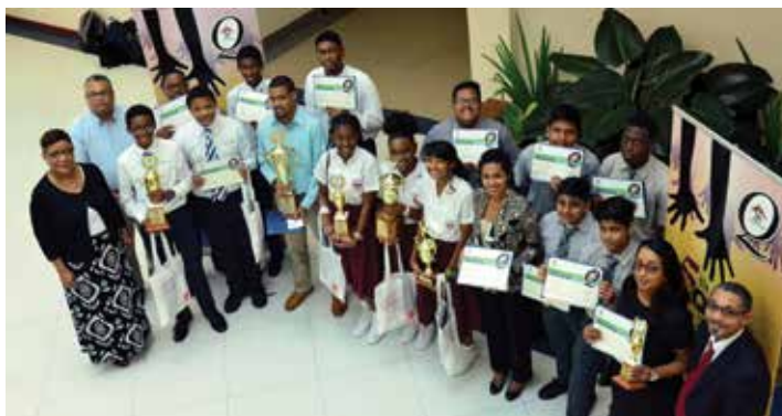
Top 4 Schools – the ACTT's 5th National Quiz on Quality Assurance in Higher Education and Training.